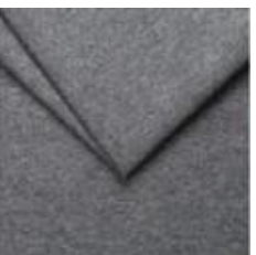
19 – Anthracite