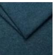
15 – Azur