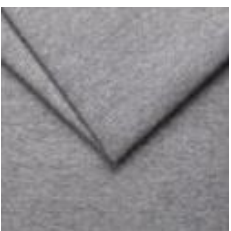
18 – Grey