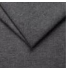
20 – Graphite