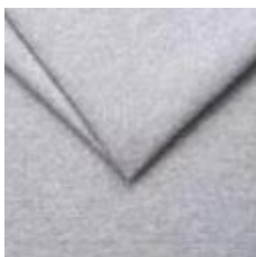
17 – Silver