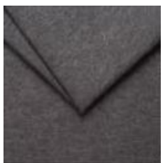
21 – Elephant