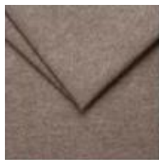
4 – Antelope