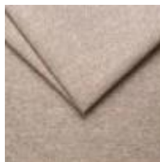
2 – Beige