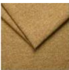
10 – Curcuma