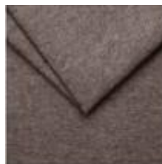
5 – Taupe