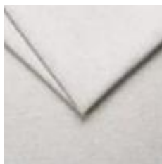
1 – Cream