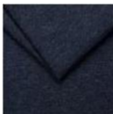
16 – Deep Blue