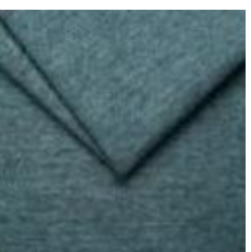
14 – Aqua