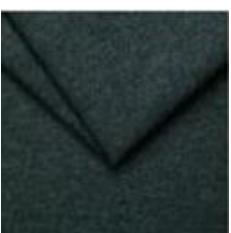
13 – Bottle Green