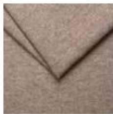
3 – Camel