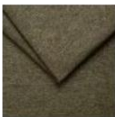
11 – Olive