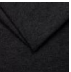
22 – Black