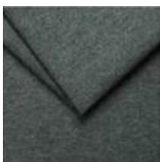
12 – Winter Moss