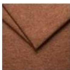
8 – Rust