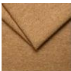
9 – Amber