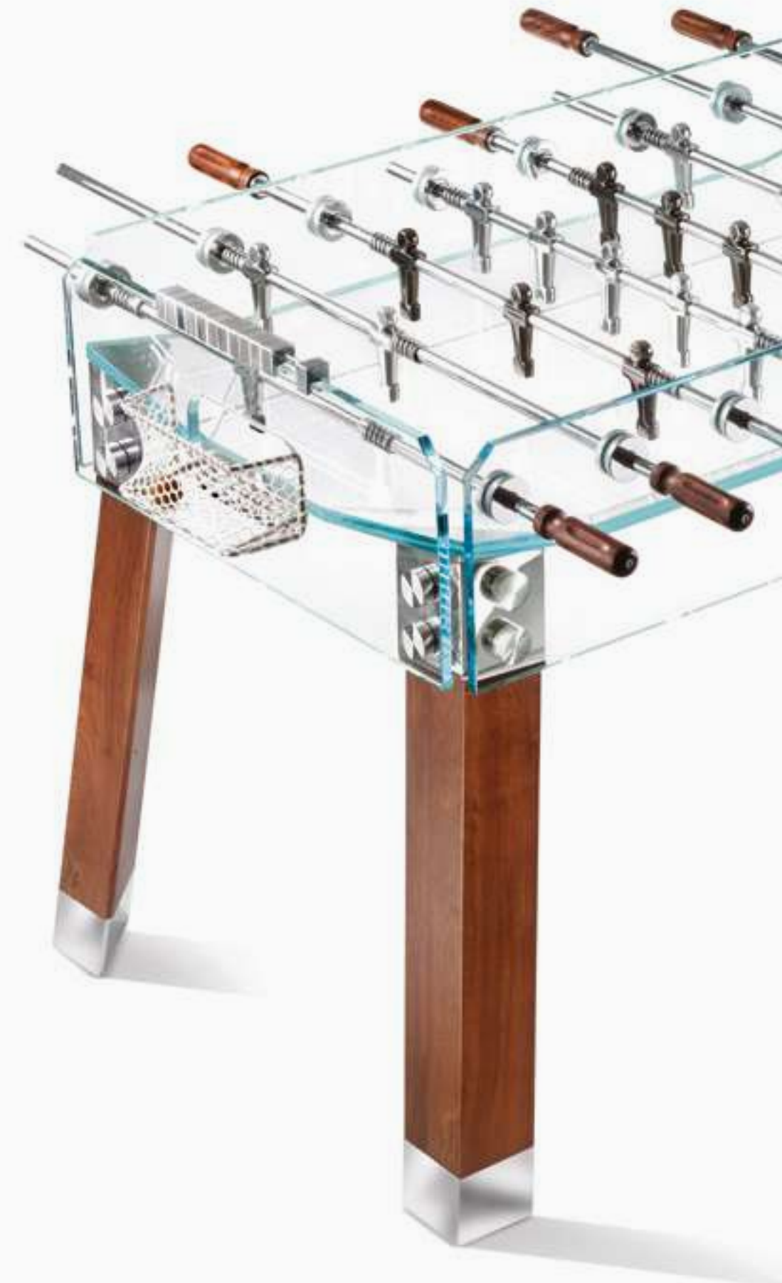
Contropiede Wood radiates class with the luxurious, transparent crystal playing field that contrasts with the solid wood details