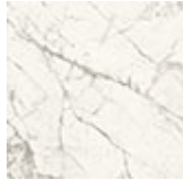
KM24 matt Invisible