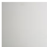
OP71 matt white