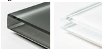
extra clear frosted glass graphite painted