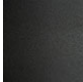
GFM69 graphite embossed