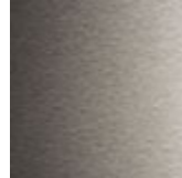
satine stainless steel