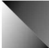
extra clear graphite