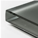
extra clear frosted glass graphite painted